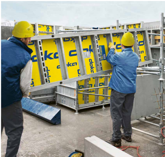
Economical, fast and safe at non-crane-assisted sites, too