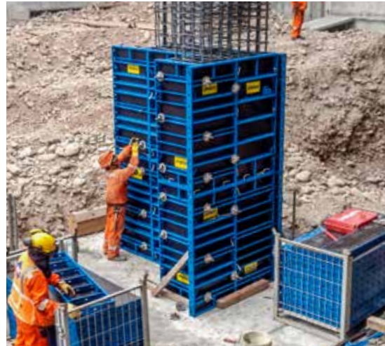
Even columns with complex geometry can be easily formed