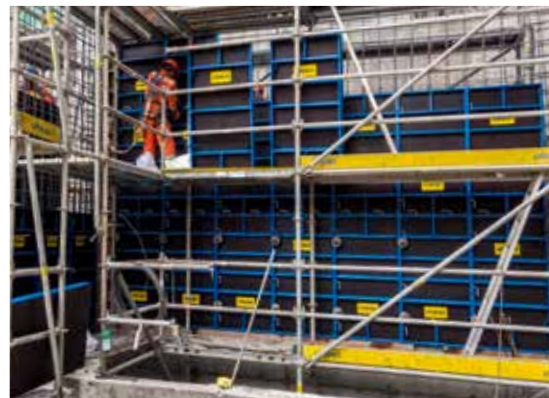
Fast forming of walls thanks to simple handling