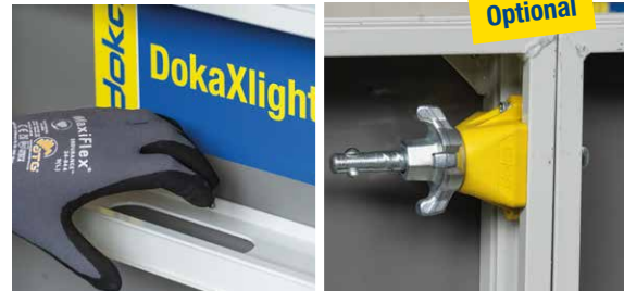
Easy handling with integral grips and low-noise, time-saving forming with the DokaXlight I-Connector