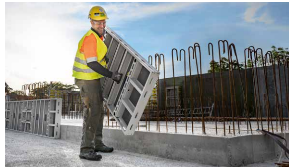
DokaXlight is the ideal formwork whenever crane lifts are not an option or lightness is important for fast progress