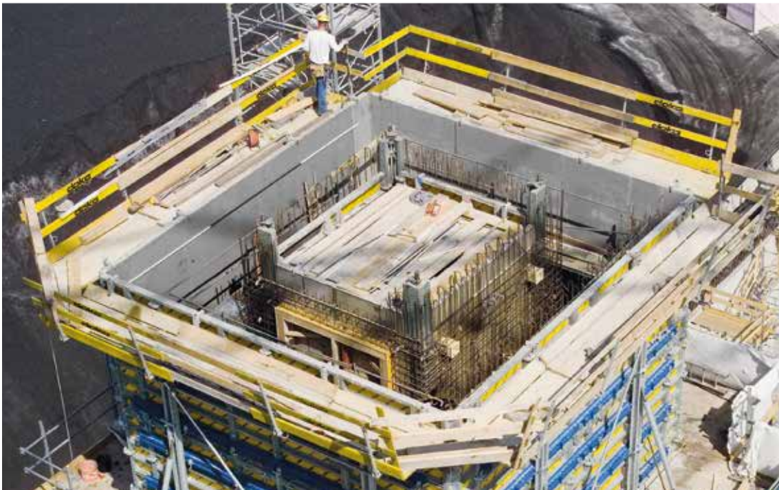
Shaft formwork together with Automatic climbing formwork Xclimb 60 and Framed formwork Framax Xlife in action on the Timelkam combined-cycle gas turbine power plant, Austria

The perfect combination for shafts: Shaft platform plus Framax stripping corner I. The formwork is closed and opened without any crane assistance, simply by turning a spindle with a hammer or reinforcement rod or with the easy-to-handle ratchet.