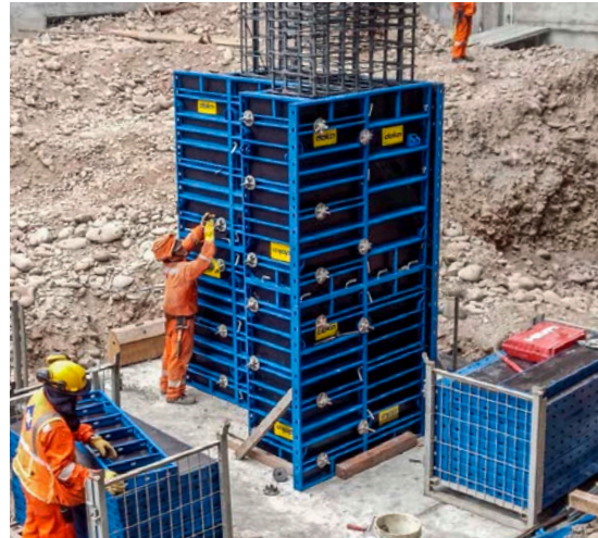
Even columns with complex geometry can be easily formed