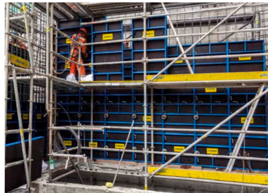
Fast forming of walls thanks to simple handling