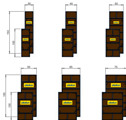
Standard panels with 5 cm logical system grid for perfect adaptability