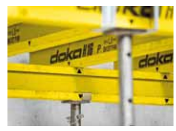
▲ The '1-2-5' system-grid and the unique spacing marks on the beams make forming-up a lot faster, and also a lot

"Dokaflex 15 wins out over traditional forming methods for its attractive price level", explains Product Manager Wolfgang Stadlbauer. When handled correctly, Dokaflex 15 is good for up to 120 formwork re-use cycles. This versatile system also stands out for benefits like short formingtimes and easy handling on the site. This is thanks to the optimised weight and load capacity of its system components, which makes it lighter than conventional formwork systems, and by its complete solutions for slabs and downstand beams. To help users work out what quantities are needed, and to facilitate formwork use on the site, Dokaflex 15 comes with the pre-defined '1-2-5' system-grid. This grid uses marks on the beams to show the maximum spacings between the props and beams, permitting 'no-worry' pouring of slabs up to a max. thickness of 15 cm. With only a few different system components, Dokaflex 15 is an ingenious all-in-one solution for floor-slabs and downstand beams for short forming-times and easy handling on the site. With Dokaflex 15, construction firms obtain top-quality concrete finishes and save time as less finishing work is needed. //