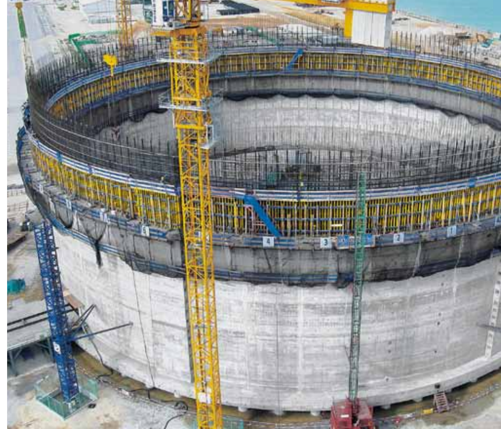
▲ The crane-lifted Climbing formwork MF240 ensured systematic forming processes as well as rapid construction process during construction of the LNG tank Map Ta Phut in Thailand that measures 82 m in diameter and is 52 m high.

pose particular challenges for formwork technology. Crane-lifted Climbing formwork MF240 or 150F ensure systematic forming processes as well as rapid construction progress when building large-volume tanks, machine houses and stair towers.