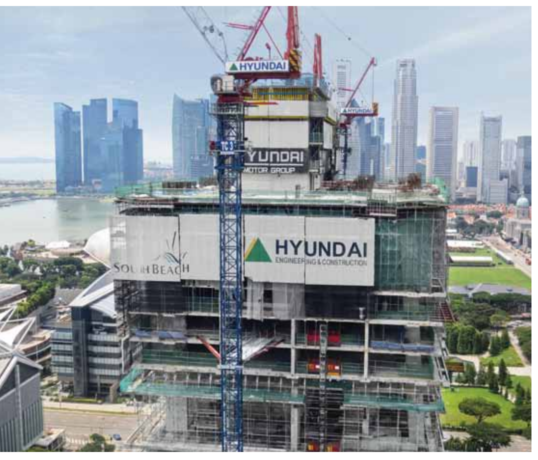
▲ A new landmark project in downtown Singapore: South Beach Development