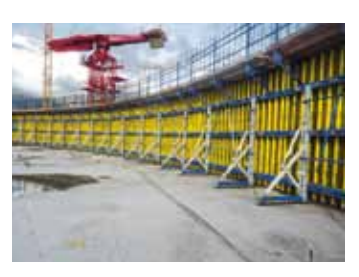
▲ First step of inside formwork are support by Scissor-action spindle and special starter. Inside the job site is clean and tidy.