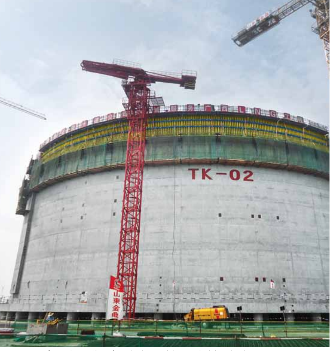
▲ Construction speed is very fast and each process is intense and orderly conducted.