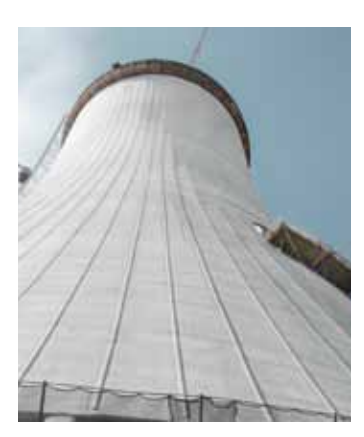
▲ Doka provided the formwork solution based on the Cooling-tower formwork SK175 for the construction of the 164 m high cooling tower of the coal power station Sostanj in Slovenia. The selfclimbing system for pouring sections of 1.50 m high allow for precise forming with extremely short cycling times.

Demand for energy around the world is rising, a fact that requires energy to be supplied in an environmentally friendly, efficient and safe way. Construction lots for building different types of power stations ranging from water to gas- and coal-fired power all the way to wind energy systems are as diverse as the forms of energy generation. In response Doka provides custom as well as holistic solutions and underscores its versatility with its in-house Competence Centre Power Plants.