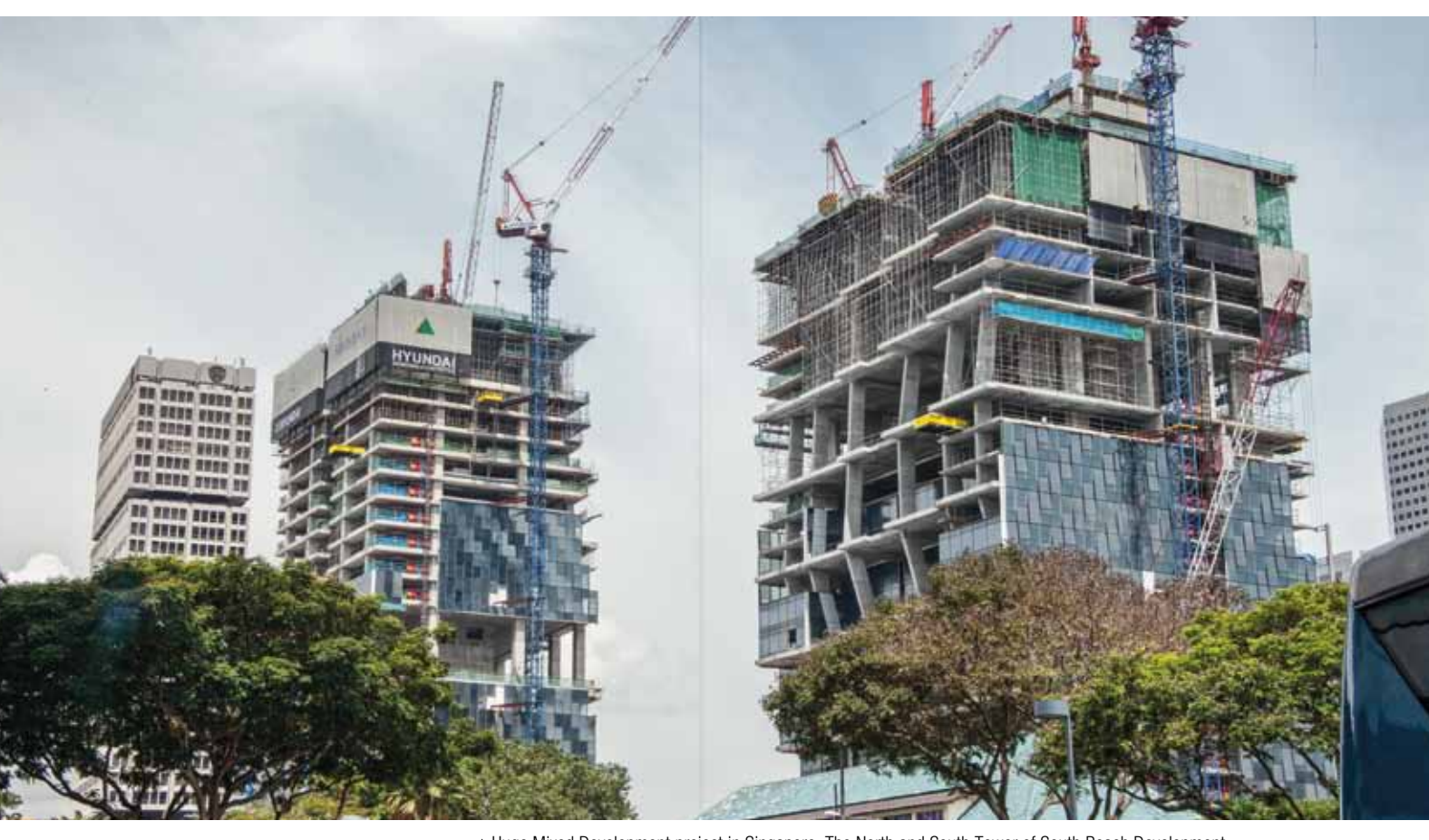
▲ Huge Mixed Development project in Singapore, The North and South Tower of South Beach Development