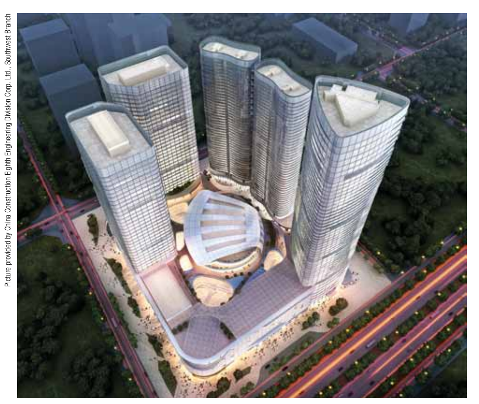
▲ The center will consist of five super-highrise towers and high-end business premises. Doka supplies formwork for the highest building.