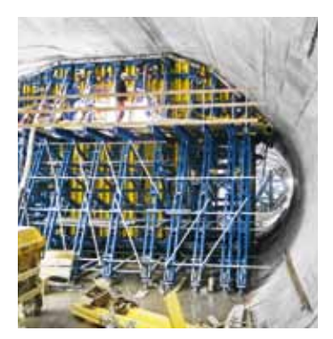
▲ Cross-section changes and varying structural geometries can be realised safely using the flexible Load-bearing tower SL-1.

Current urban development presents numerous new challenges calling for lasting infrastructure solutions. Especially in the area of public transportation construction companies are confronted with demanding tasks. With its many years of experience and high-performing systems Doka serves as a reliable partner when it comes to formwork solutions for infrastructure projects.