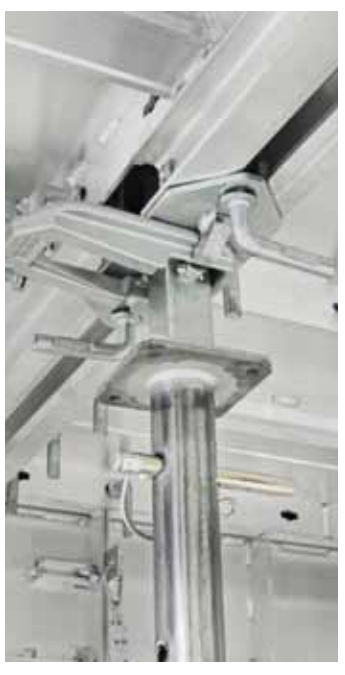
▲ A special stripping head allows fast and easy stripping of slab panels.

Go to www.doka-onego.com and www.doka.com for additional information. //