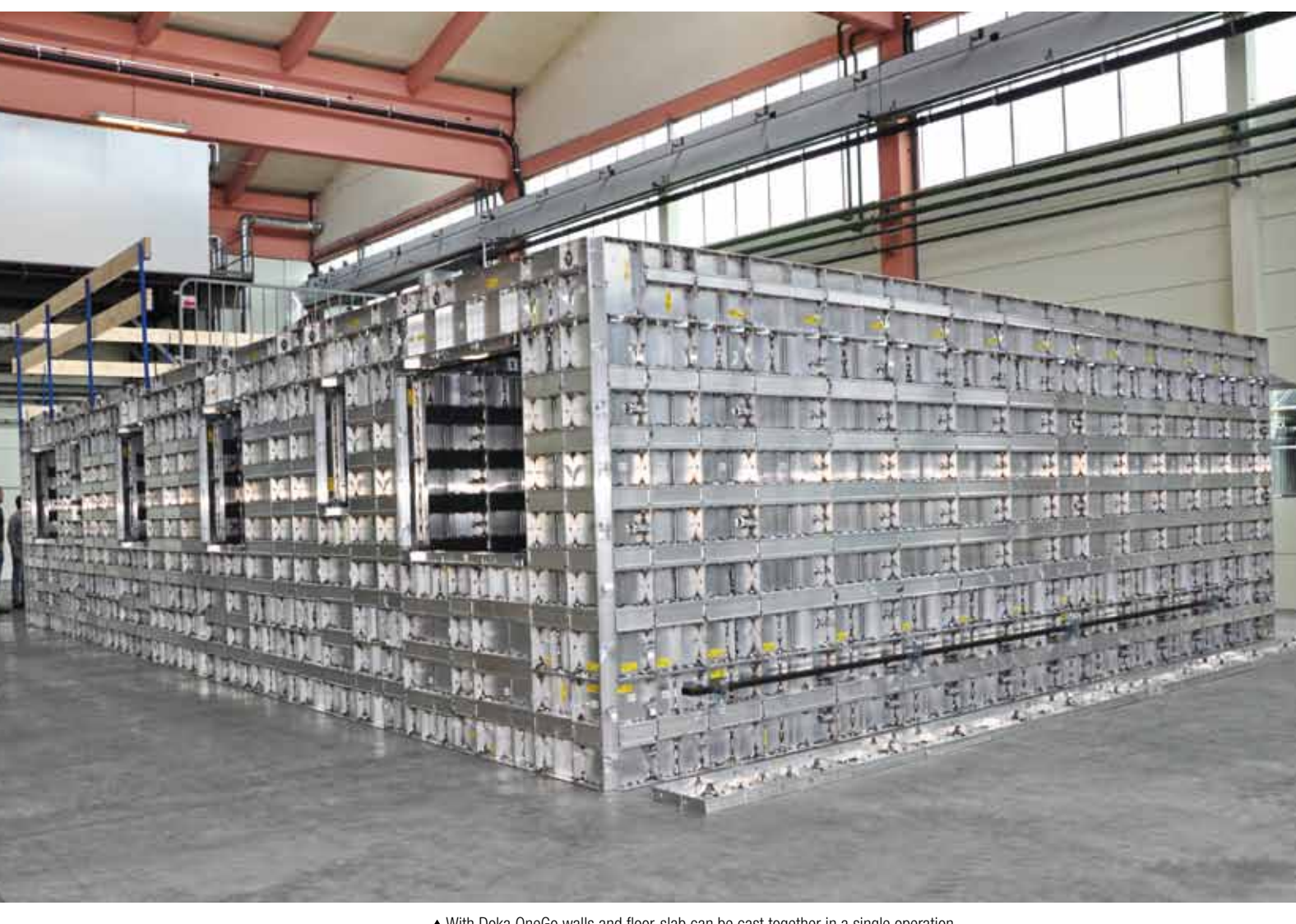
▲ With Doka OneGo walls and floor-slab can be cast together in a single operation.