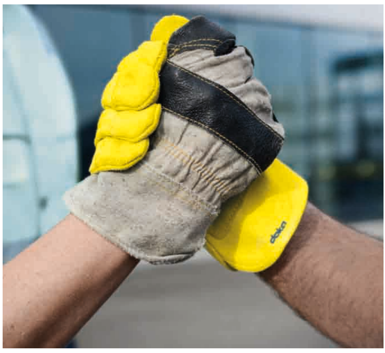
▲ Innovation is the key to our success. Our core aim is to constantly adjust our service in line with our customers' requirements.

more safe and more cost-efficient. As one of the market leaders, we are obliged to constantly develop new concepts and systems to support our customers' aim of improving speed and safety of the construction process. With our innovations, we always keep ourselves one step ahead of the competition. A good example for such solutions is the Xsafe plus, a pre-assembled working platform that can be folded and equipped with side railings for wall and column formwork.