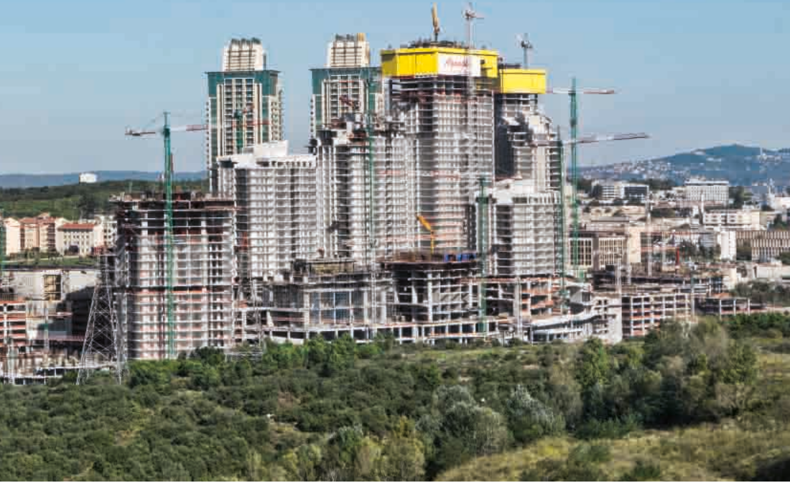
▲ Once Maslak 1453 is finished, it will count 24 residence and office towers.

in Istanbul. Thanks to its short cycle time, the construction process is accelerated, resulting in a floor being cast approximately every six working days.