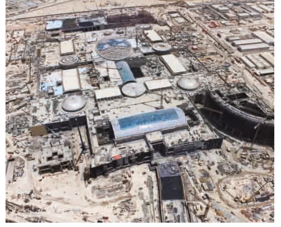
▲ Vast quantities of formwork material were required for a 33,000 m² decking area.