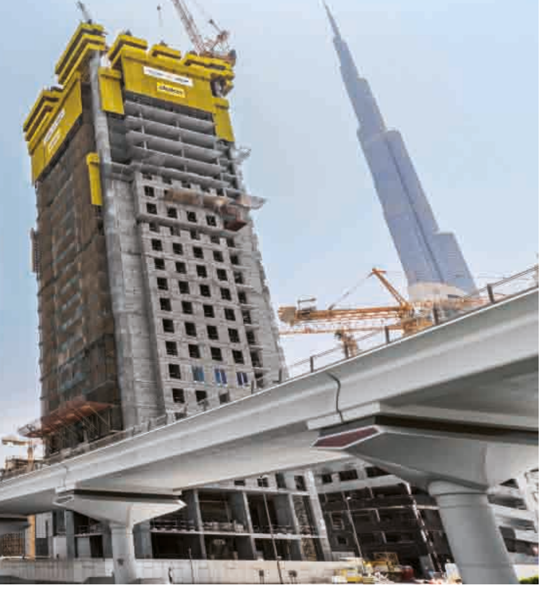
▲ Doka's formwork and protection screens in bright yellow are easy to spot in downtown Dubai.