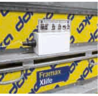
▲ Wall sensor and slab sensor during application