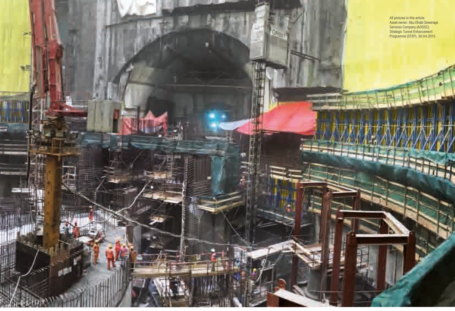
▲ Once completed, this project will not only represent a masterpiece of engineering, but furthermore a landmark in terms of Abu Dhabi's status as a sustainable city.