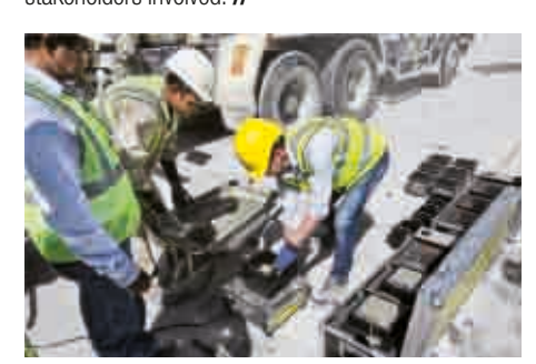
▲ The calibration is made by casting six cubes, measuring their temperature development and testing their compressive strength at a certain maturity. This leads to a correlation curve between maturity and compressive strength.

Acknowledged by some of the most respected international quality assurance standards, including DIN, British Standard and Eurocode, Concremote has the proven experience, industry support and cost efficiency to enhance the GCC's sustainable approach to construction, while offering multiple benefits to all stakeholders involved. //