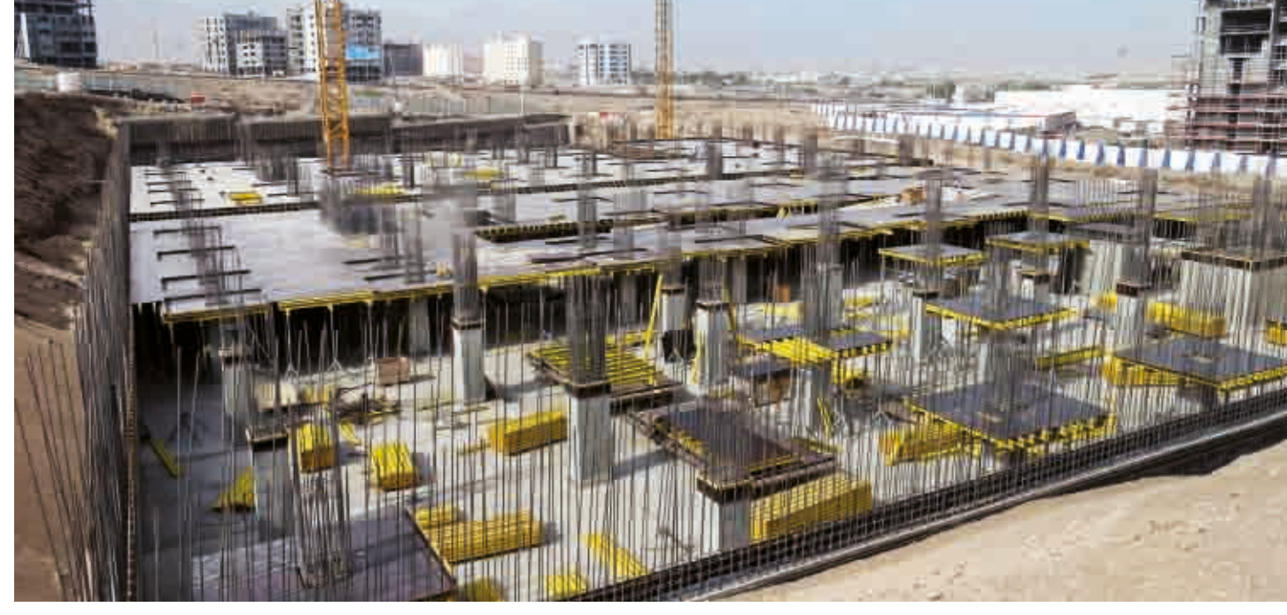
▲ Concremote: Redefine your program. Push progress.