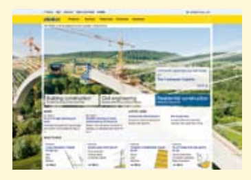
Take a 'click' into Doka's new Online World. You'll like it!