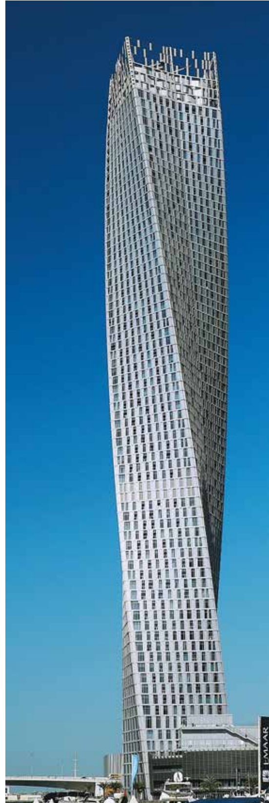
▲ The Cayan Tower, a luxury apartment building with a striking helical shape, turning 90 degrees over the course of its height.