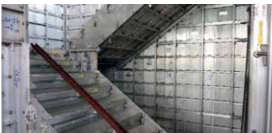
▲ Thanks to test assembly we can every time ensure the correct setup of the system - especially for special areas like as staircases, special shaped walls, etc.