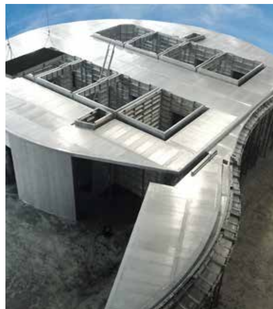
▲ Exact adaption to to project specific requirements eliminates adjustment work on site and speeds up forming time