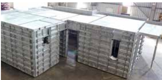
▲ Doka Aluminum Formwork System produced by MFE is a high-performing formwork designed to cast walls and floor-slabs quickly in a single pour

The resulting structure is extremely strong, highly accurate, and achieves a high quality surface finish with only minimum "skim coat" required for final surface finishing. Using the system, our customers are able to dramatically increase the speed of construction with high-rise buildings constructed at a rate of 4-5 days per floor and landed properties constructed at a rate of one house per day using a single set of forms. MFE aluminium formwork systems can be operated by trained nonskilled workers and requires no specialist tools or equipment.