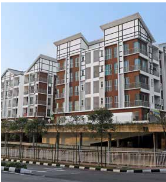
▲ Cameron Highlands, Summer Square comprising ground floor and 4 storey low rise apartment buildings with retail at ground level. Retail units cast first and apartment floors completed at a rate of one floor every 5 days.