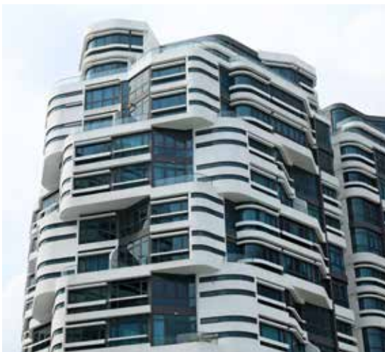
▲ Multi generational and harmonious residential sanctuary, where a cycle time target of 5 days per floor was achieved due to the formwork solution.