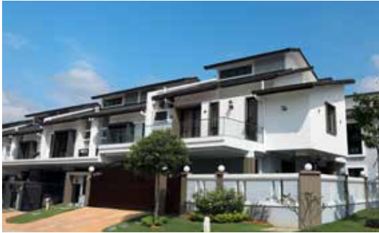
▲ 150 Mid-range linked townhouses in the Shah Alam area in Kuala Lumpur