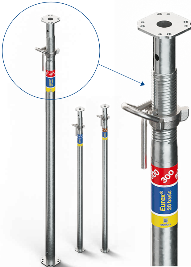
Permissible load-bearing capacity (kN)

The floor prop with full load-bearing capacity. Lower weight, proven strength – Thanks to the use of innovative materials, the Eurex 20 basic is significantly lighter than comparable props in its load-bearing class. And all this with the usual high performance and durability.